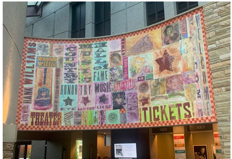
▲The view from my registration desk this week!

In closing, as the start of a new MPI year approaches, take a few moments to think about where YOU can help out in the next 12 months (or even just one event) and while you're at it, remember to connect with the MPI world all around you as you do the work of connecting people and creating great experiences!