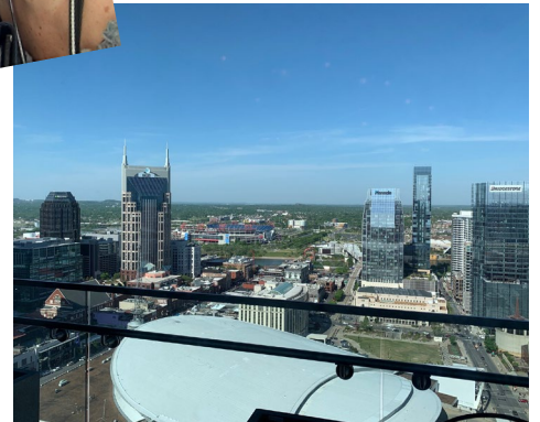
▲ Spectacular view of Nashville from the Embassy Suites Nashville Downtown

It's moments like this that make me so happy to be a part of Meeting Professionals International and remind me how important all the relationships are that we build together when we gather at MPI events.