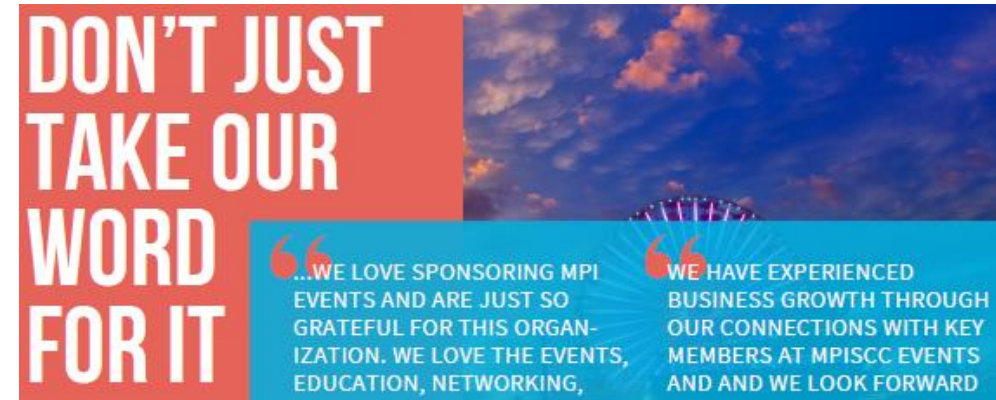
MPISCC 2024 Sponsorship Prospectus