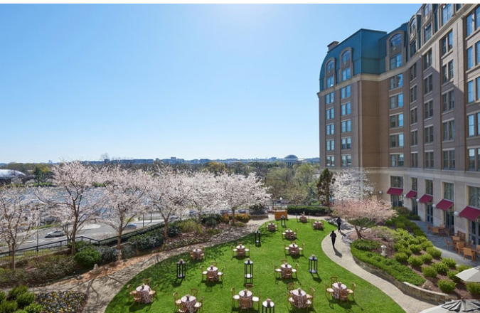
SALAMANDER WASHINGTON DC

entrepreneurs, the nation's capital is a leader in key industries such as tech, biotech/pharma, medical and education. The city's economic and sustainability initiatives have attracted businesses like Amazon, Boeing and Raytheon to the area, expanding its intellectual capital to new industries including space exploration.