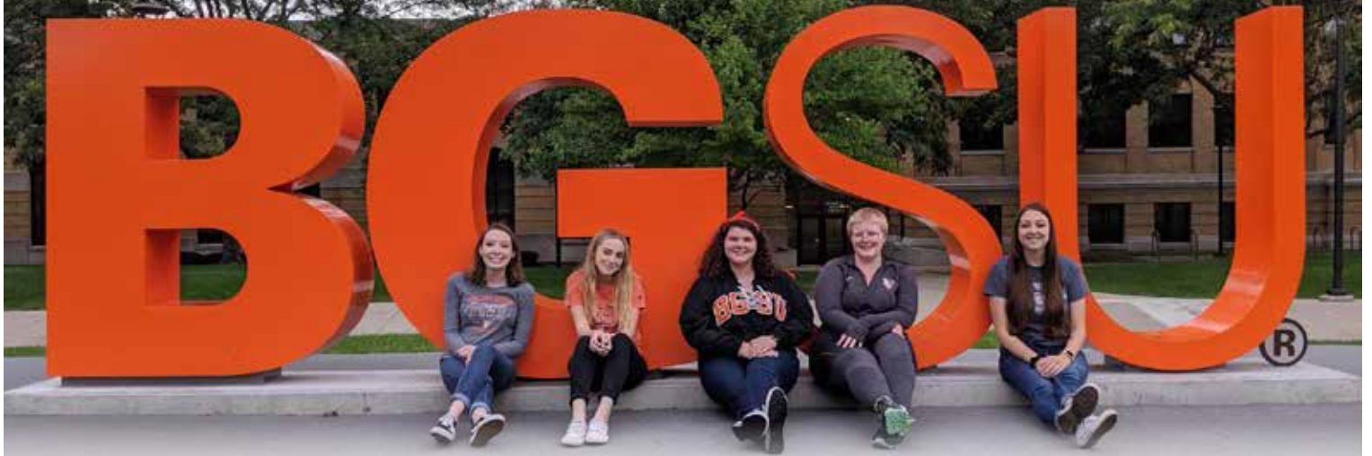
MPI Ohio Student Chapter at Bowling Green State University, The Falcons, Board of Directors