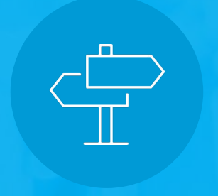
Printing & Signage