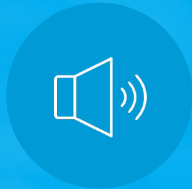
Audio Visual & Production

Annual Sponsorships are available in the following areas: