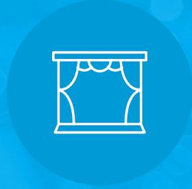
Event Design, Décor, Florals