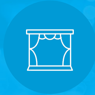
Event Design, Décor, Florals