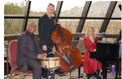
Live music accompanied our programs