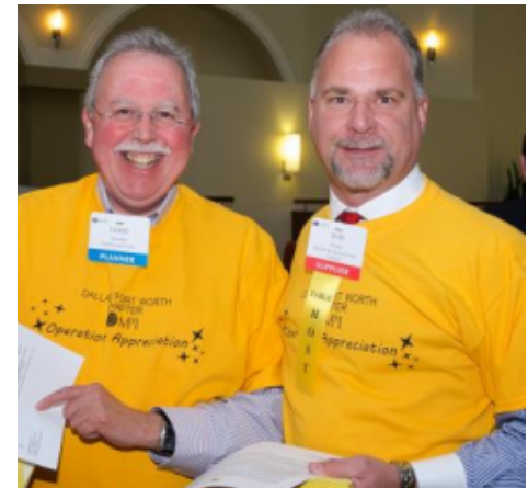
Operation Appreciation in action