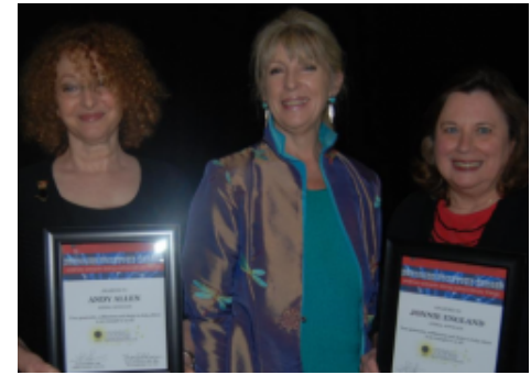
One of many Hometown Heroes were honored throughout the year