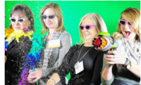
Fun Green Screen Action Shots at a Chapter meeting