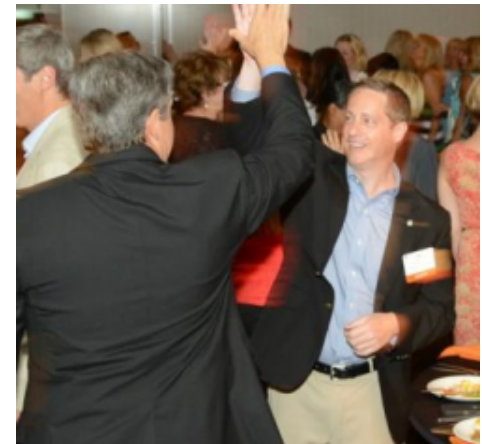
Interactive meetings throughout the year filled with energy and enthusiasm!