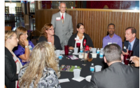
Round table Program offered innovative topics