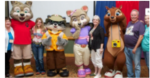
CSR Committee collected over 1,000 Teddy Bears to donate to first responders in the DFW Metro-plex.