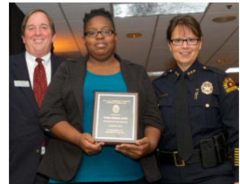
MPI D/FW honored the Dallas Policeman of the Month