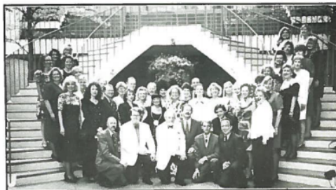
Seventy-six members of the D/FW chapter attended the MPI Annual Conference in Atlanta in late June.

Throwback Thursday postings on the chapter Facebook page were a big hit with our members.