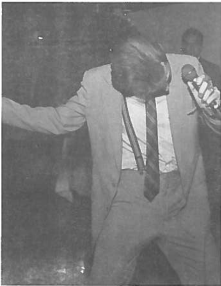
Southwest Airlines ticket agent "boogies and sings" the "Welcome Aboard" announcement.