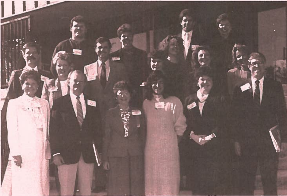
Pictured above are some members of our D/FW Chapter delegation attending the MPI Professional Education Conference in San Diego, December 7-10, 1986.