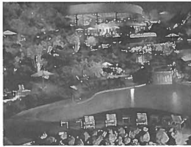
Wyndham Buttes Resort Tempe, AZ

We can arrange a meeting across town. Or across country.