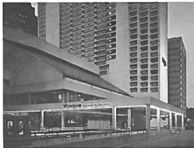
Wyndham Franklin Plaza Philadelphia, PA