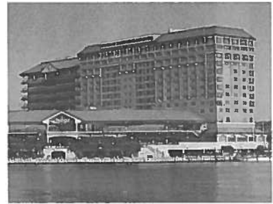
Wyndham Harbour Island Tampa, FL

At Wyndham, we can handle anything from intimate receptions to sophisticated multimedia productions at more than 125 locations throughout the United States, Canada and the Caribbean. From prime center city locations to convenient airport and suburban settings. Not to mention our dazzling resort destinations. And with us, you get the right space, the right equipment and – as always – the right attitude. That's The Right Way. The Wyndham Way. For more information, contact National Group Sales at 800-327-8321.