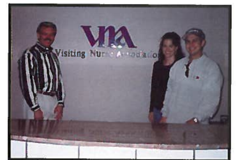
VNA Meals-on-Wheels Thanksgiving