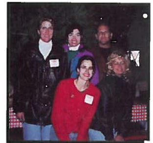
Love for Kids Event at Circle 'R' Ranch

Make a resolution to get involved in one or more Community Service Projects in the New Year. For information on future events see Community Service article on page 9.