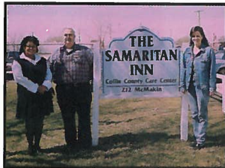
"Toiletry Drive" for the Samaritan Inn