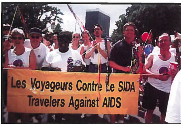
Aids '99 Lifewalk

Make a resolution to get involved in one or more Community Service Projects in the New Year. For information on future events see Community Service article on page 9.