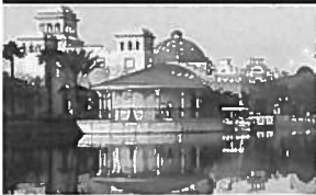
DISNEY'S CORONADO SPRINGS RESORT

ENGAGING, COMPELLING, INSPIRING...THE WALT DISNEY WORLD® RESORT