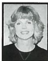
Cindy Provence PDQ Results Printing