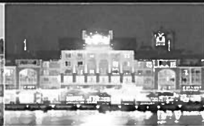
DISNEY'S BOARDWALK RESORT