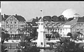
DISNEY'S YACHT & BEACH CLUB RESORTS