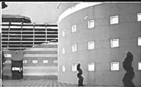
DISNEY'S CONTEMPORARY RESORT