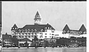
DISNEY'S GRAND FLORIDIAN RESORT & SPA

Only here can you partner with Disney's professional development and creative resources to produce a meeting that will energize your attendees, motivate them to think differently, and awaken a level of creativity and innovation you never thought possible. When you host your meeting at one of our spectacular convention resorts , you can tap into the world-renowned Disney Institute to develop customized programming , provide keynote speakers