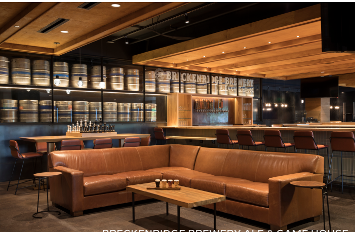
BRECKENRIDGE BREWERY ALE & GAME HOUSE

A selection of our fine Colorado cuisine is available every day for In Room Dining service. Daily, 6am-11pm