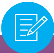
Chart your career through the MPI Career Center and Job Board. MPI's popular job board allows you to see new positions two weeks before non-members, giving you a competitive advantage. Upload your resume for employers to find you before a position is posted publicly. Once uploaded, you will receive a free professional resume critique from TopResume.

Global connections will grow your network. MPI is the industry's largest association boasting 15,000 members globally in 75 countries. Friendships, new ideas and innovative growth awaits you.