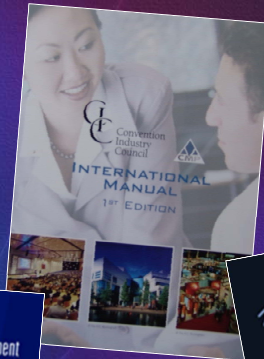
1 st Edition CIC International Manual