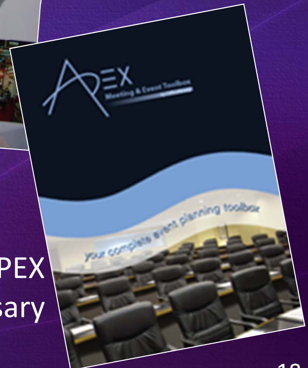
Current APEX Glossary