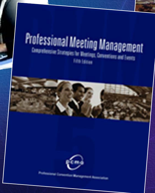
5 th Edition PCMA Manual