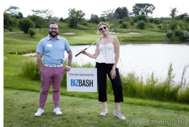
2019 Golf Tournament BizBash