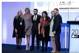
MPI Toronto Rewards Program Winners