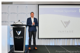
PD November Event Vantage Venues