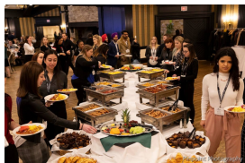
Breakfast at GMID 2019 Old Mill