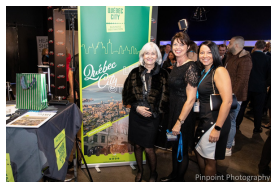
2020 Awards Gala - Reception Activation Québec City Business Destination