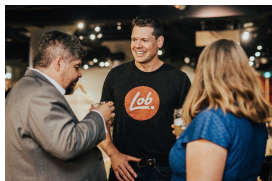
Just Networking Lob Toronto