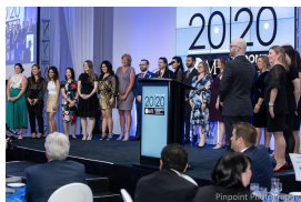
Nominees for 2020 Awards Gala

Further information about chapter awards are shared later in this document.