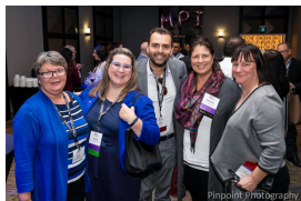
2019 AGM & Volunteer Recognition